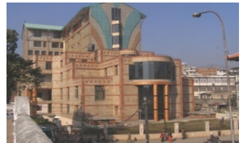
Bir Hospital, Kathmandu, Nepal