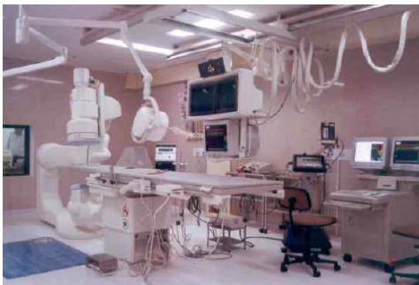
(Procurement, Installation & Commissioning)