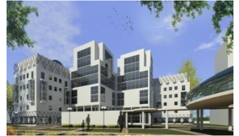
National Centre for Disease Control, Delhi