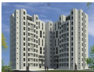
Hostel Block at AIIMS, New Delhi