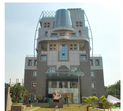
Sports Injury Centre, New Delhi