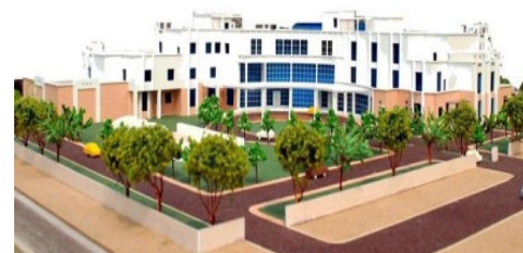
Cancer Hospital, Bathinda