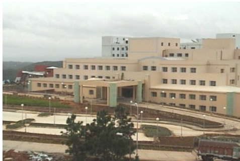
NEIGRIHMS, Shillong, Meghalaya