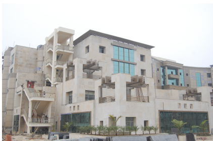
Super Speciality Hospital at SGPGI, Lucknow