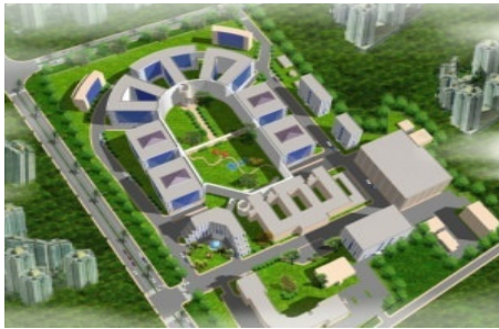
Redevelopment Plan of Safdurjung Hospital, Delhi