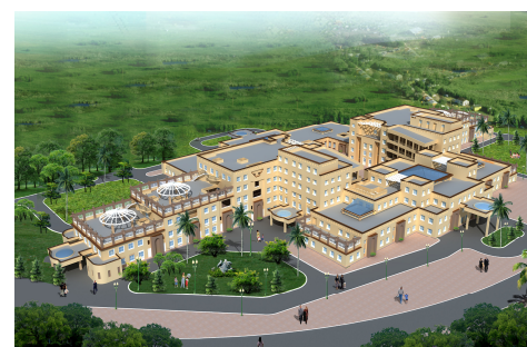
Mental Hospital at Tezpur, Assam