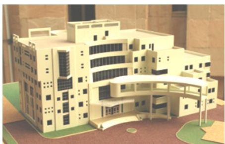
Super Speciality Hospital, Tanda