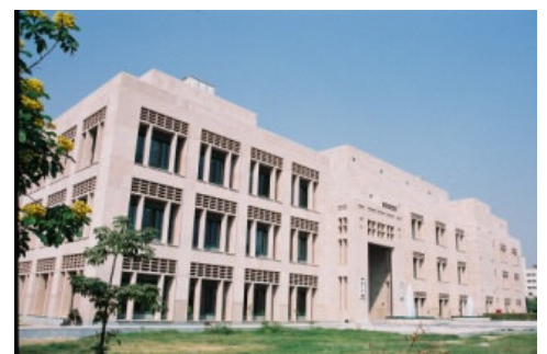
National Institute of Biological, Noida, UP