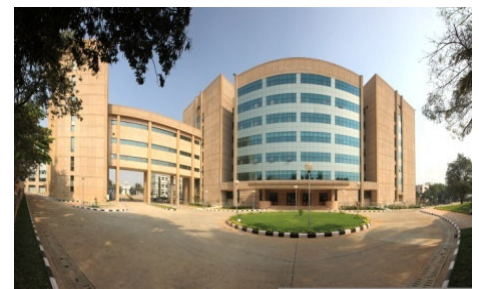
Nizam Institute of Medical Sciences Hyderabad