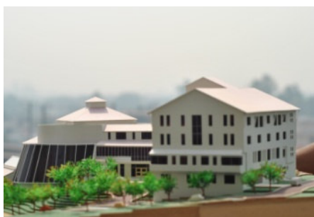
Hospital at Dickoya, Sri Lanka