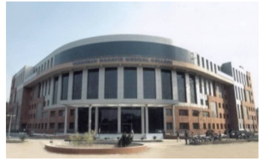
VMMC, New Delhi