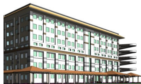
All India Institute of Ayurveda, Sarita Vihar, New Delhi