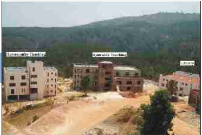
North Eastern Institute of Ayurveda and Homeopathy, Shillong