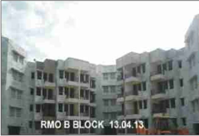
Lady Hardinge Medical College, Housing, New Delhi