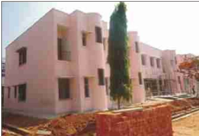
National Institute of Unani Medicine, Bangalore