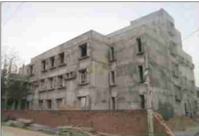
Physiotherapy Workshop, Patiala