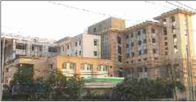
All India Institute of Ayurveda, AYUSH, Sarita Vihar, New Delhi