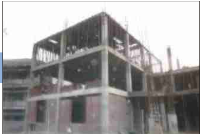
Nursing College, Patiala