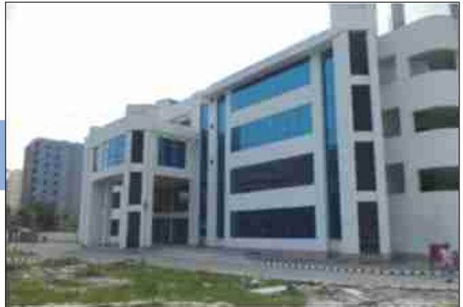
Indian Institute of Chemical Biology (IICB), Kolkata