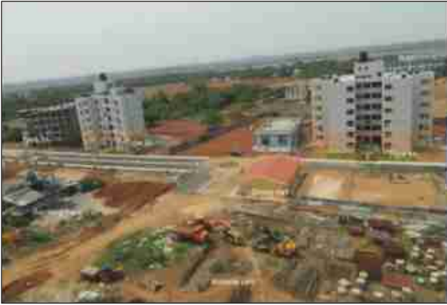
Housing Complex for AIIMS-like Institution, Bhubaneswar