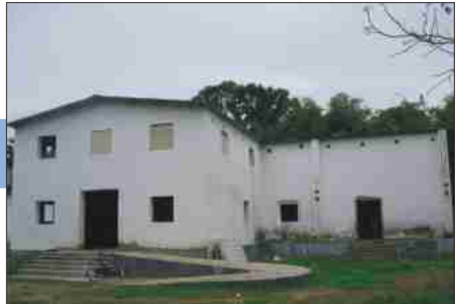
BSL-3 Laboratory for Animals at Regional Medical Research Centre ( R M R C ), Dibrugarh, Assam