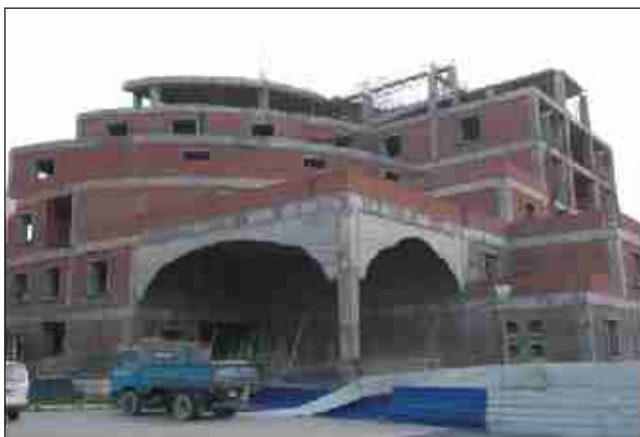
Guru Teg Bahadur Diagnostic Centre, Govt. Medical College, Amritsar