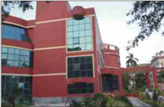
Guest House, Kolkata Medical College, Kolkata

The Guest House building is G+1 storied RCC framed structure. The building has 4 nos. of Guest room, Kitchen and Dining hall etc. Building is completed including furnishing.