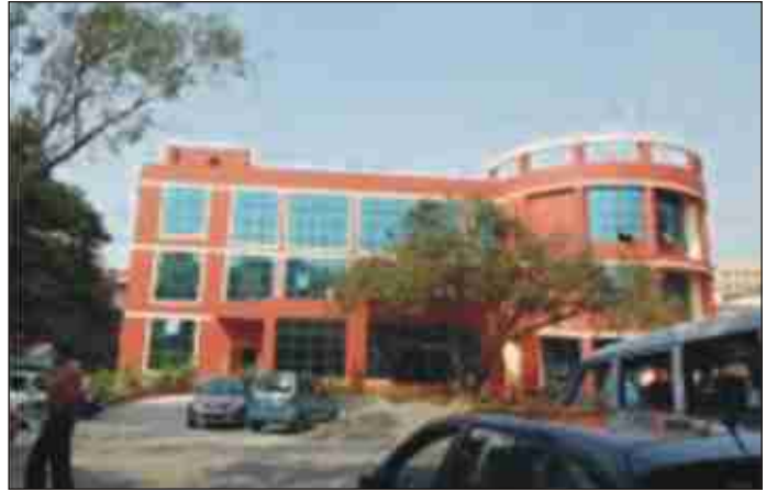
Academic Block, Kolkata Medical College, Kolkata

Academic Block is G+2 storied RCC framed structure. The entire building is provided with false ceiling, air conditioning, fire fighting, uninterrupted power supply, lift facility etc.