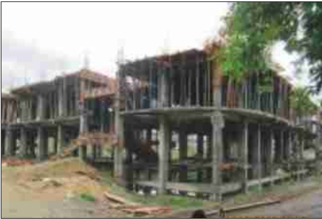
Regional Institute of Medical Sciences (RIMS), Imphal