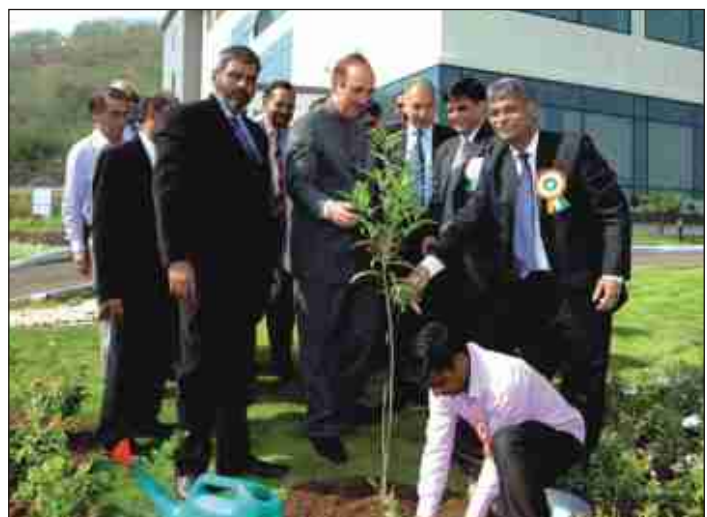
Hon'ble Union Minister of Health & Family Welfare Shri Ghulam Nabi Azad planted a Sapling on this occasion