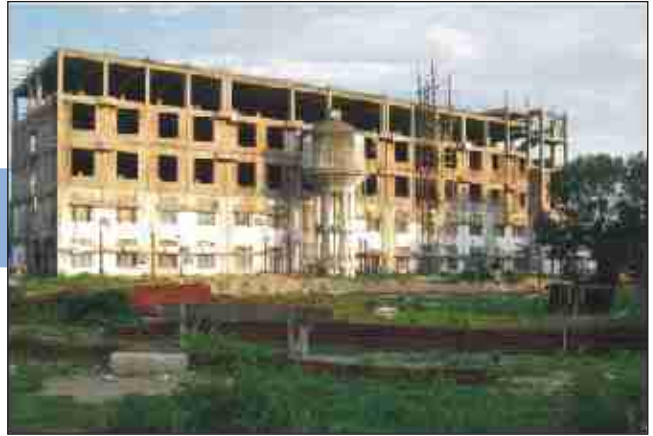
Arunachal State Hospital, Naharlagun