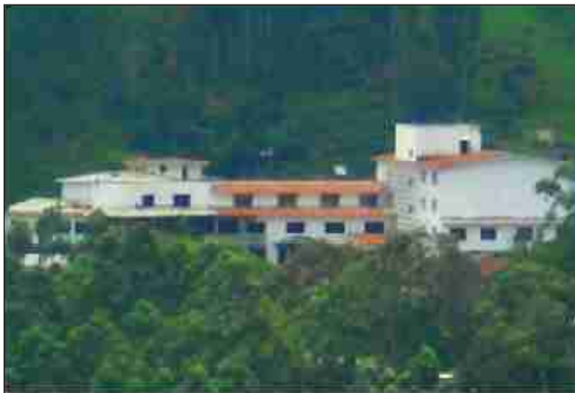
District General Hospital Hatton, Dickoya, Sri Lanka

" If you don't find God in the next person you meet, it is a waste of time looking for him further. "