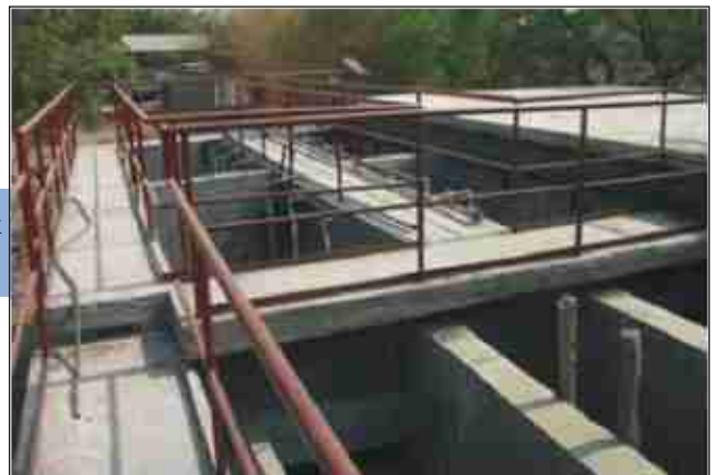
STP at Microbial Containment Complex ( M C C ), Pune