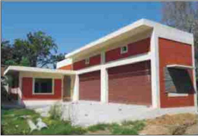
Government Medical College, Patiala (Electrical)