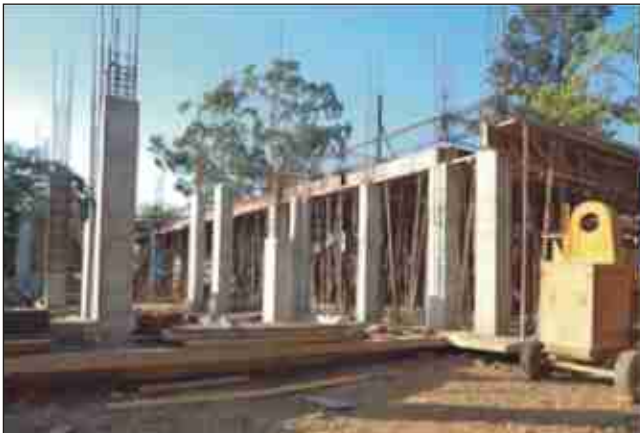
Indian Institute of Integrative Medicine ( I I I M ), Jammu