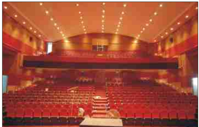
Auditorium Hall, Kolkata Medical College, Kolkata

Academic block has auditorium hall with sitting capacity of 630 persons, two seminar halls with sitting capacity of 175 persons each at 1st & 2nd Floor, Medicine hall at 1st & 2nd Floor. Building is completed including furnishing.