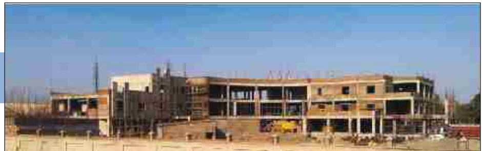
Advanced Cancer Diagnostic, Treatment & Research Centre, Bathinda