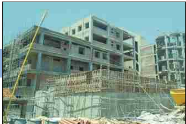
Dr. Rajendra Prasad Govt. Medical College, Super Speciality Block, Kangra, Tanda