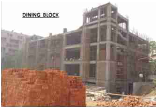
AIIMS, Dining Block, New Delhi